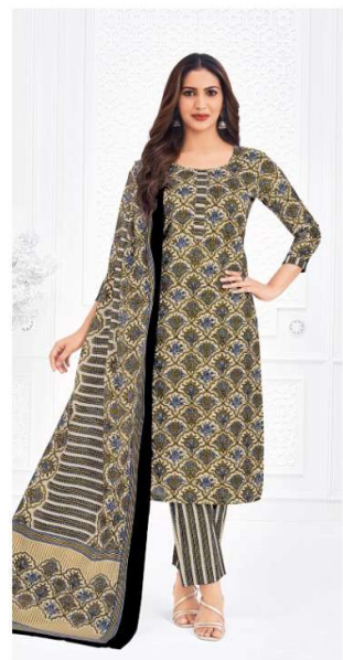
D No. 513