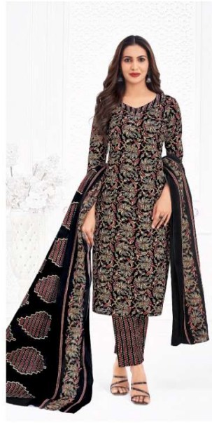
D No. 505