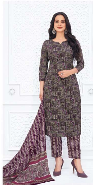
D No. 509