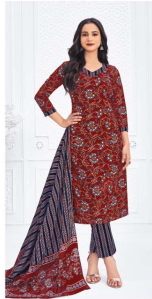
D No. 510