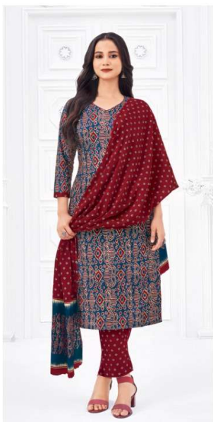
D No. 512