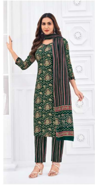
D No. 507