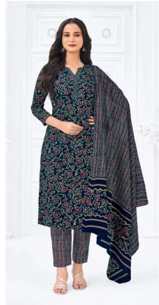
D No. 511