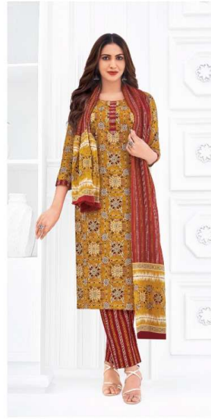
D No. 506