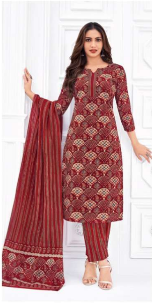
D No. 504