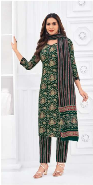
D No. 508