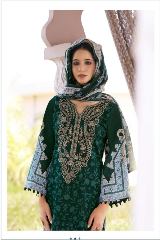
"Fashion is very important. It is life-enhancing and, like everything that gives pleasure, it is worth doing well." D.NO:960-006