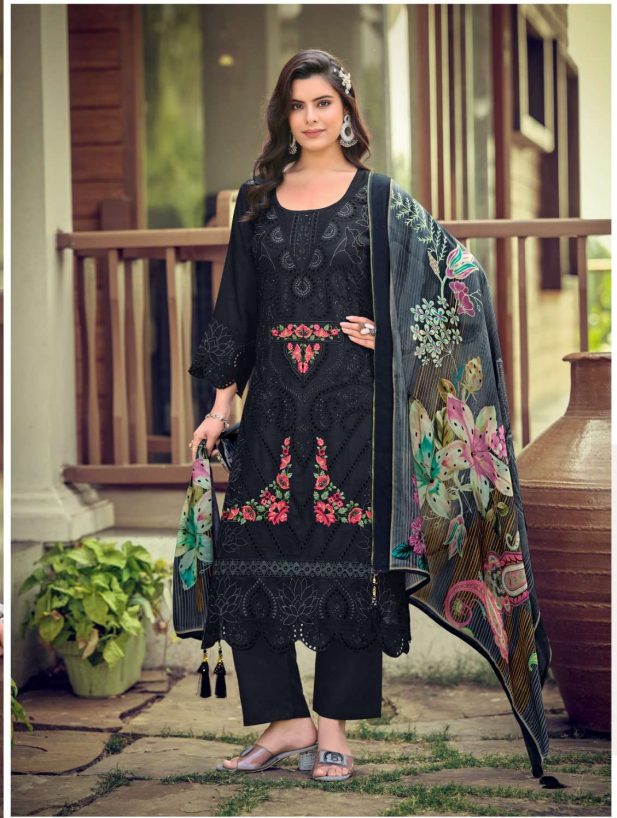
A timeless wardrobe