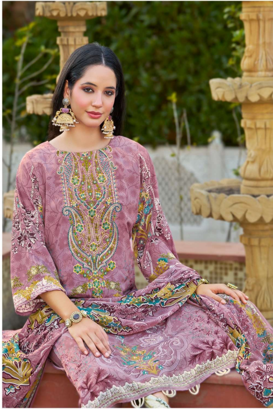
"STYLE IS THE ONLY THING YOU CAN'T BUY. IT'S NOT IN A SHOPPING BAG, A LABEL, OR A PRICE TAG. IT'S SOMETHING REFLECTED FROM OUR SOUL TO THE OUTSIDE WORLD—AN EMOTION." 1145-002