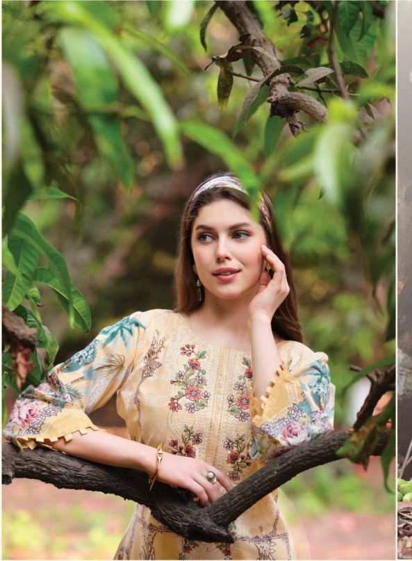
True style isn't about following trends blindly; it's about understanding who you are and expressing that identity through what you wear, with confidence and authenticity.