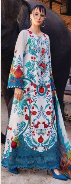
D NO 19002