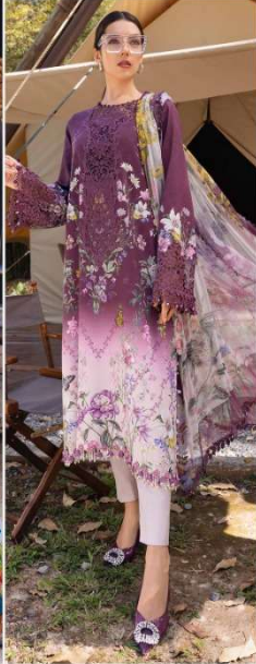
D NO 19003