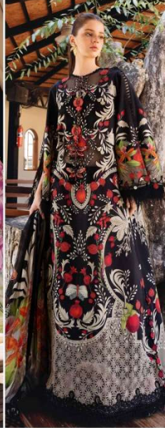
D NO 19005