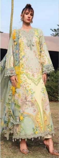
D NO 19001