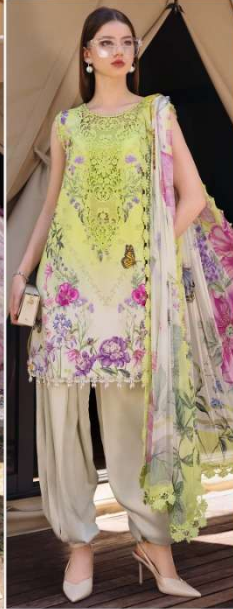
D NO 19004