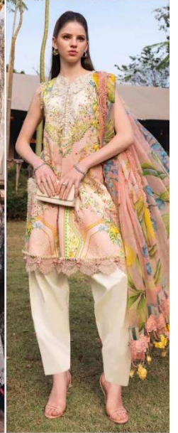
D NO 19006