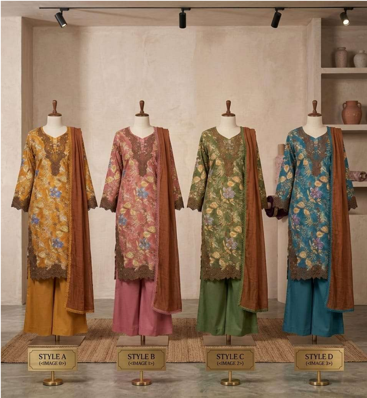
STYLE A (<IMAGE 0>)