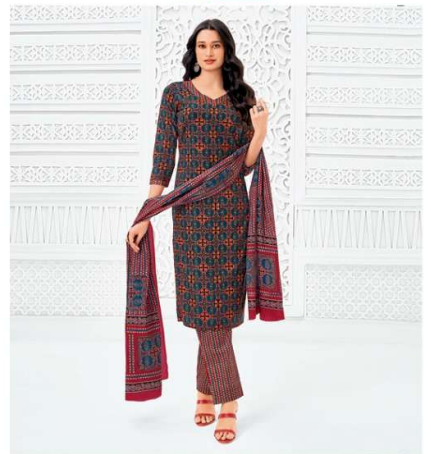
D No. 610