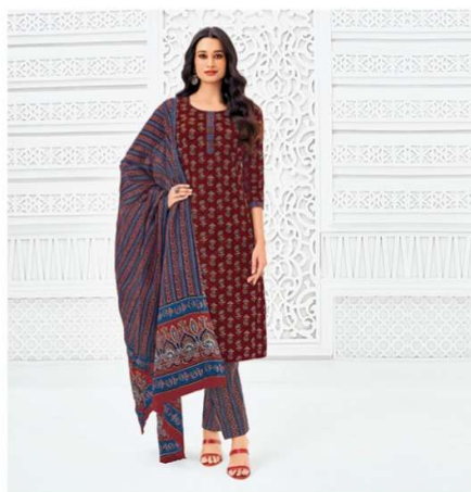
D No. 611