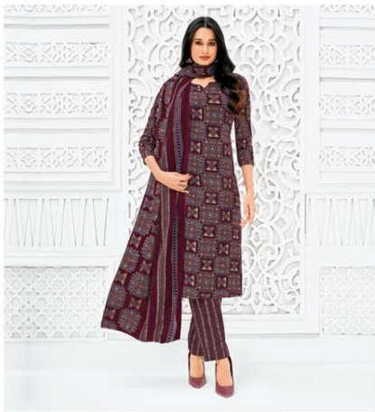
D No. 605