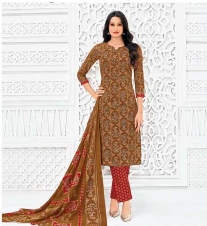
D No. 608