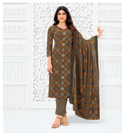
D No. 612