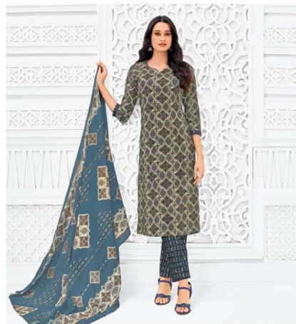
D No. 609