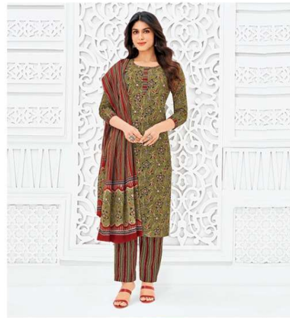
D No. 604