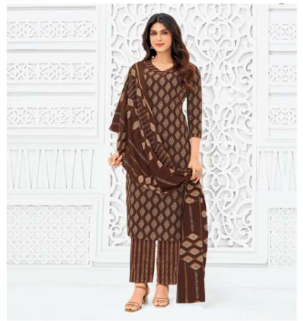
D No. 607