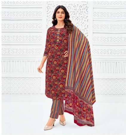
D No. 603