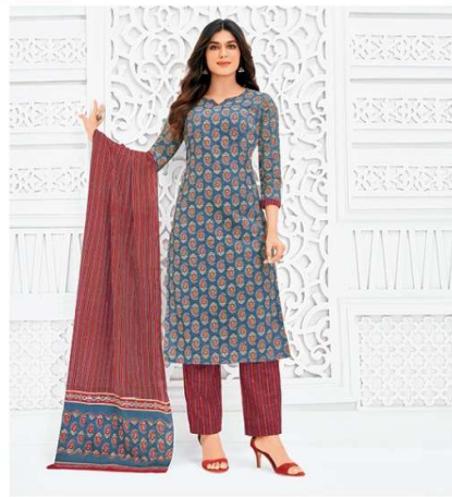
D No. 606