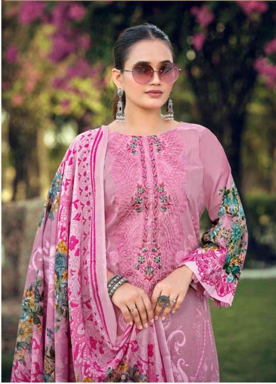
In the boutique window, a shimmering dress caught her eye. ++++