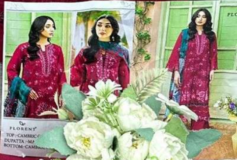
FLORENCE TOP-CAMBRIC DUPATTA-MA BOTTOM-CAMBRIC