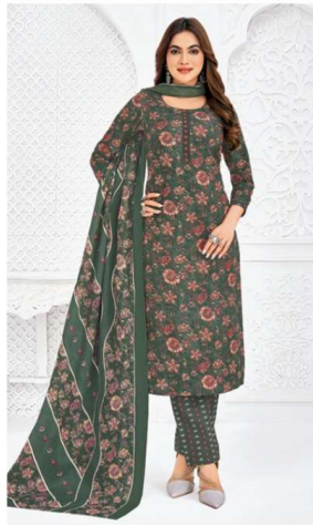
D No. 1805