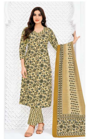
D No. 1811