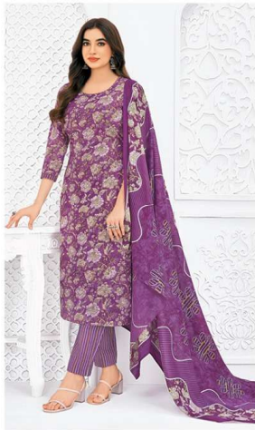
D No. 1804