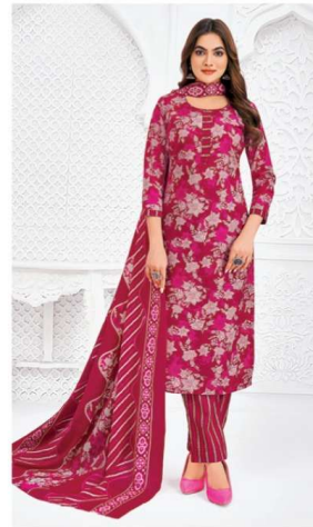
D No. 1806