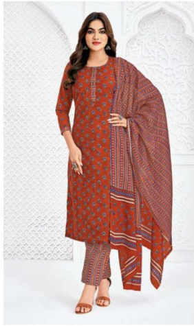
D No. 1800