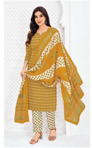
D No. 1803