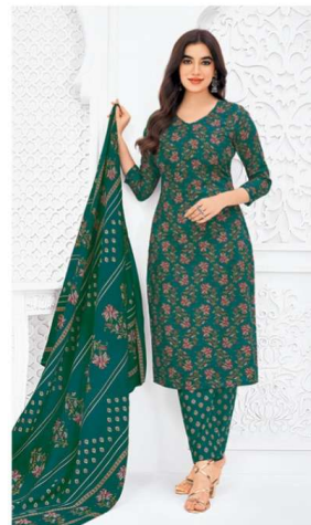
D No. 1810