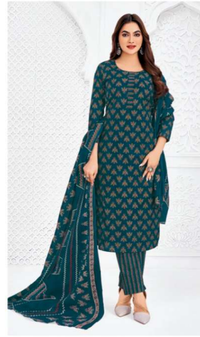
D No. 1802