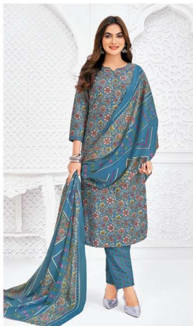
D No. 1808