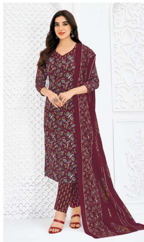
D No. 1809