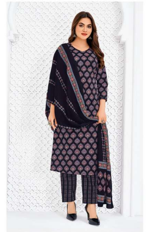
D No. 1807