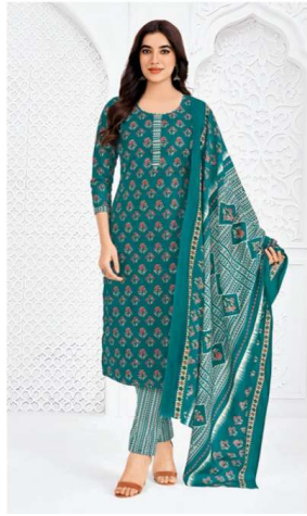
D No. 1801